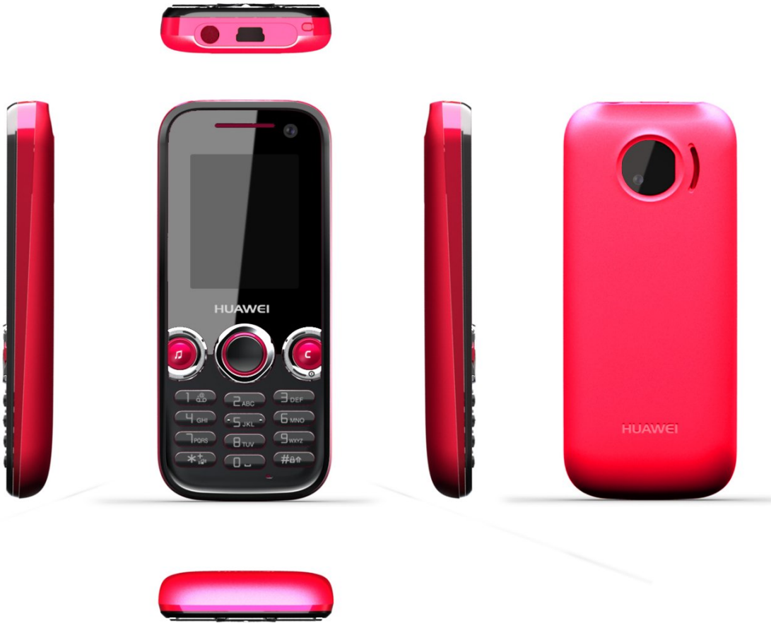
Figure 1-1 Appearance of the U2800