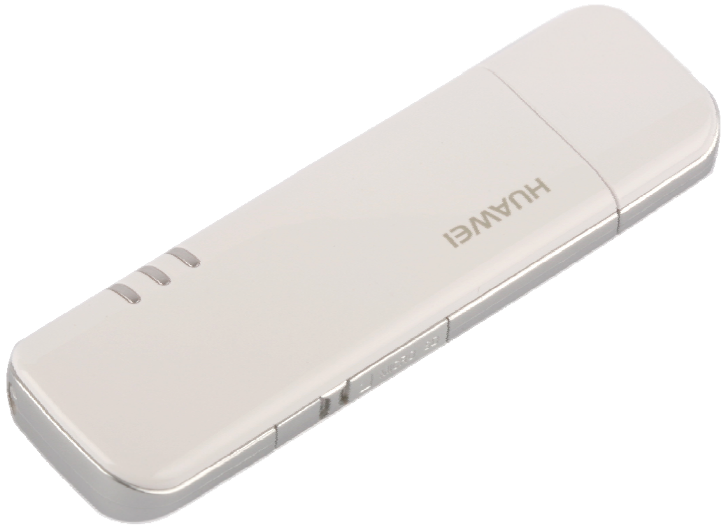
Figure 1-1 E160E profile